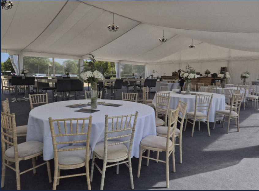
CHART STABLES | Aster Events International Dressage at Hickstead